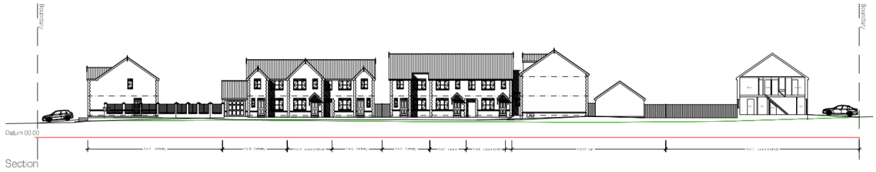
Site Section DD Residential Development at Marshlands Road, Moorends Doncaster