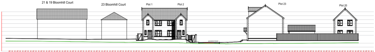
Line B - Elevation from BloomHill Court